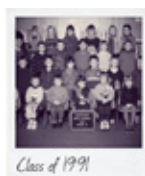
Class of 1991