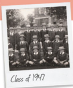
Class of 1947