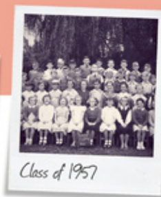
Class of 1957