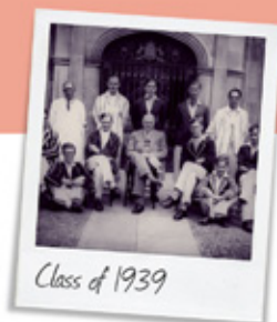
Class of 1939