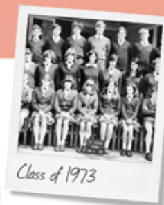
Class of 1973