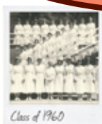
Class of 1960