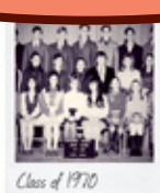
Class of 1970