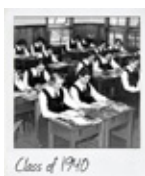
Class of 1940