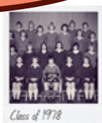
Class of 1978